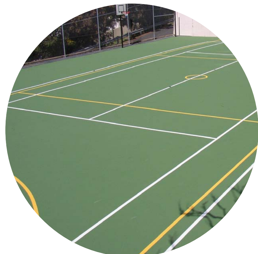
Multi use sports court