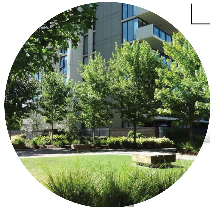
Open space lawn area