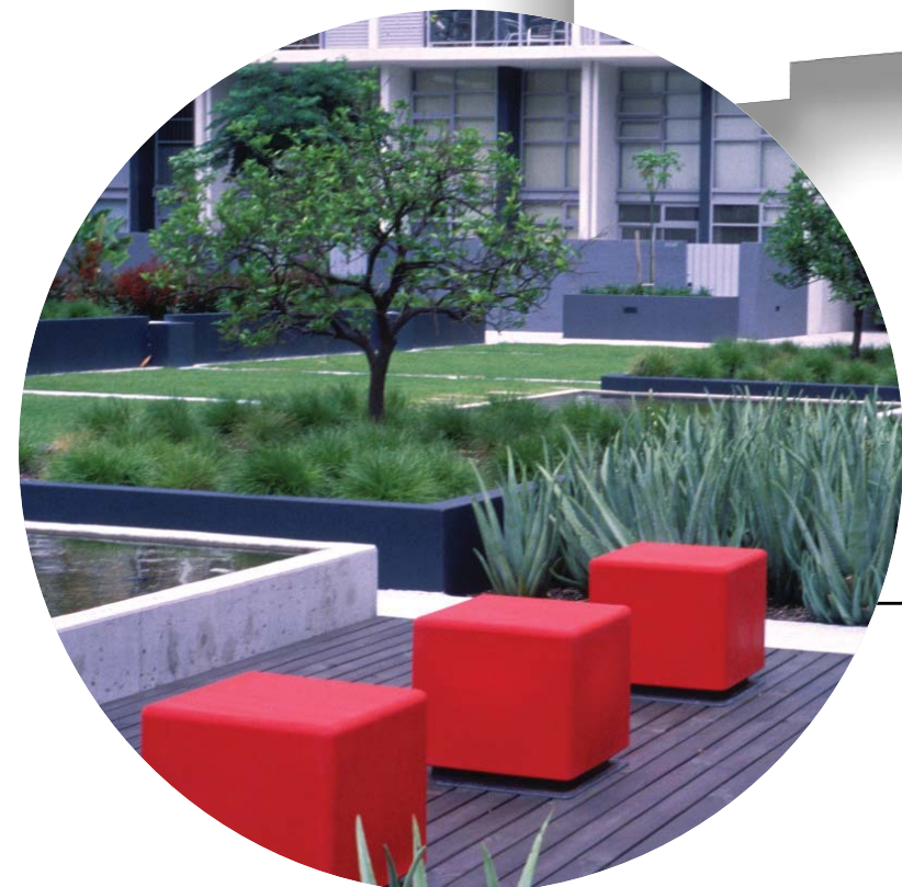
Informal outdoor seating to timber deck area