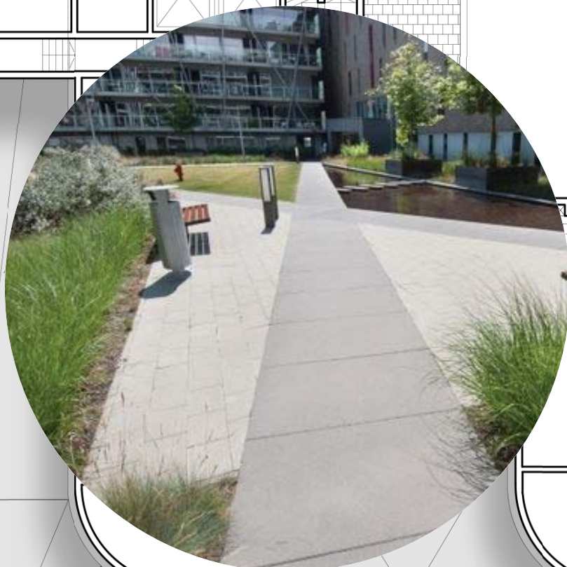
Paving and circulation path