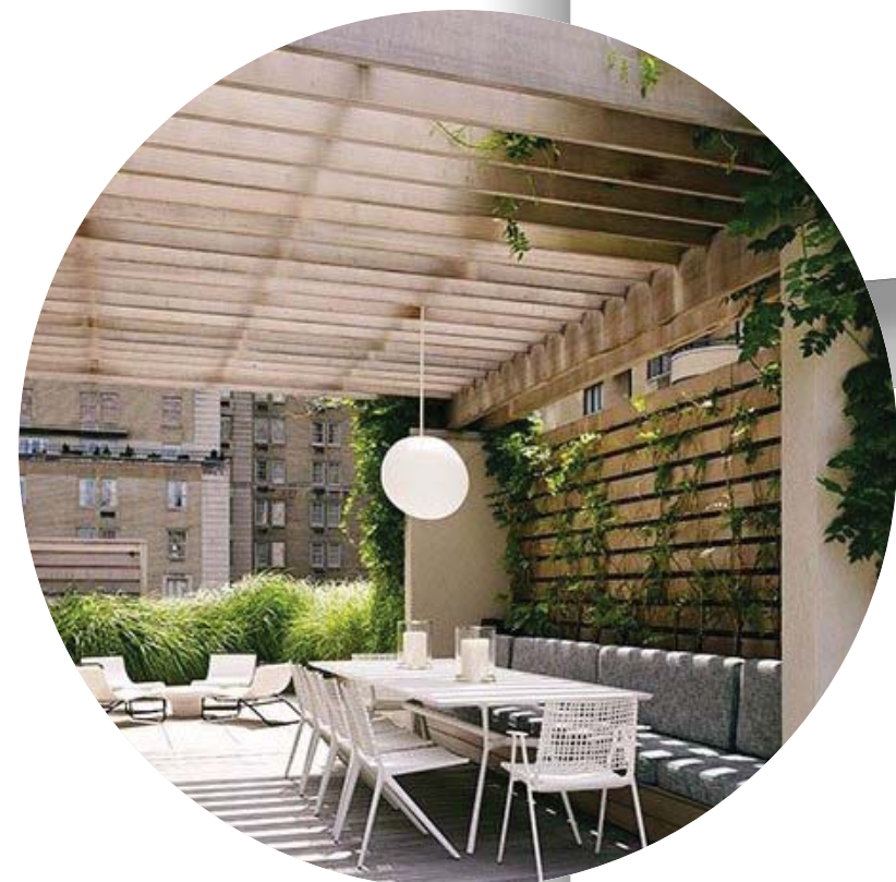
BBQ and dining facilities under pergola